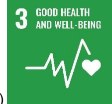
SDG3 – Good Health and wellbeing