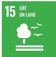
SDG 15 – Life on the land.