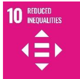
SDG 10 – Reduced Inequalities.

Our Equality and Disability Action Plans are in line with United Nations Sustainable Development Goals (SDGs). This does not affect our Equality and Disability commitment or actions. It demonstrates cross sections working together on achieving deliverables for positive outcomes.