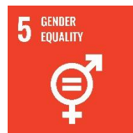
SDG5 Gender Equality