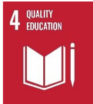
SDG 4 (Quality Education)