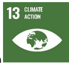
SDG 13 (Climate Action)