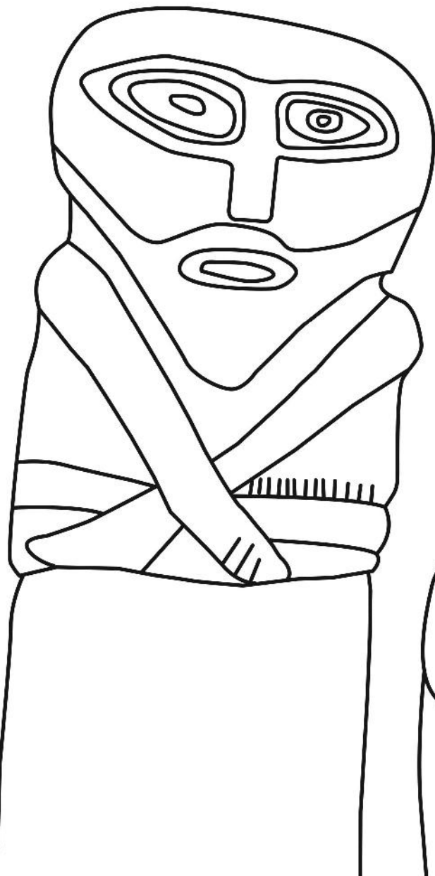
CELTIC JANUS STONES BOA ISLAND, LOWER LOUGH ERNE